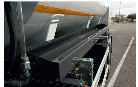
Side hose compartment.